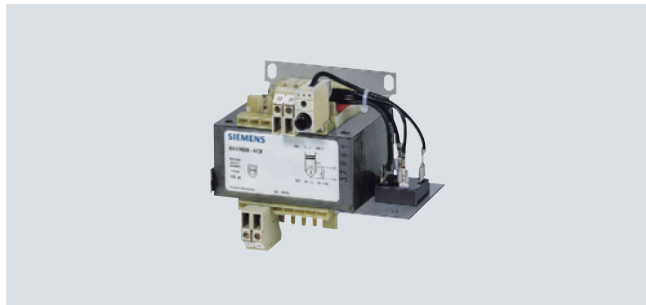
SIRIUS 4AV98 06-6CB00-2N power supply